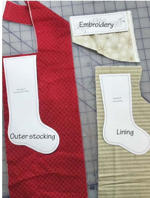
Choose your fabrics