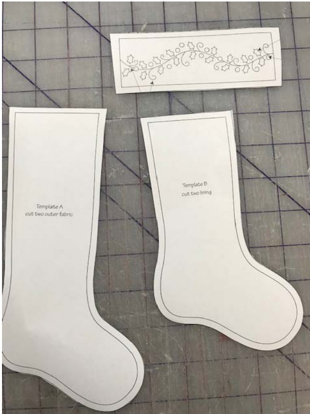
Cut out your three template pieces

If you are struggling with the construction instructions please use these photos and notes to assist when making up your stockings. - The pattern is correct, it has been tested multiple times - you just need to follow one step as instructed at a time. For the purpose of this tute I have not completed the embroidery